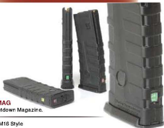
CDMAG Countdown Magazine.

For: M16 Style Polymer Made MOC ..... 900,-