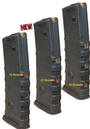
MAG3W 3 Window Model Shows Remaining Rounds.